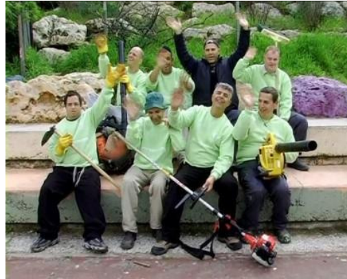
Aroma employees with special needs maintain some 100 sports fields and recreation sites in Jerusalem.

In a ceremony hosted by the Mayor of Jerusalem on November 7th, the work of outstanding employees with disabilities who have made a major contribution to Jerusalem's sports fields as part of a three-way partnership among the City of Jerusalem, Aroma Espresso Bar Israel Ltd. and Israel Elwyn was recognized. Other attendees included senior Aroma executives, officials from the City of Jerusalem and the Ministry of Social Affairs and Social Services, families of the supported employees, and Israel Elwyn (IE) staff and management.